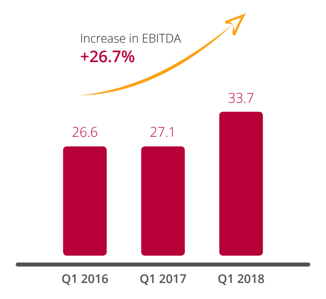
Chart 2 AmRest Group's EBITDA in Q1 2018 compared to previous years (in EUR millions)